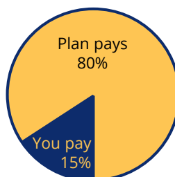
Deductible reached, coinsurance begins